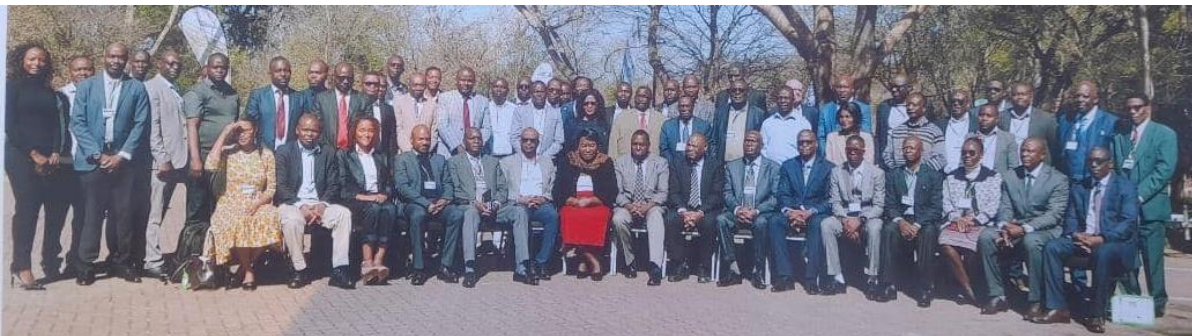
Participants at 8 th International Conference on Sustainable Transportation, June 26 th – 28 th , 2023 at Avani, Livingstone, Zambia, Africa

Everyone in any way connected with transportation is invited. This professional networking group will be of interest to funding agencies, national government authorities, parastatals, policy and decision-makers, academics, researchers, students, and professionals active in the planning, construction, maintenance, logistics, operation and safety of passenger and freight transport, road traffic, rail, maritime and aviation. End-users will also find the group of interest.