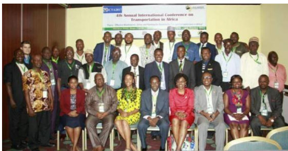
Participants at ICTA2017 in Abuja, Nigeria, Africa