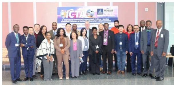
Participants at ICTA2019 in Baltimore, MD, USA

4.2 The International Road Federation (IRF) Geneva is a non-governmental, non-profit organization with the mission to encourage and promote development and maintenance of better, safer and more sustainable roads and road networks. Working together with its members and associates, the IRF promotes social and economic benefits that flow from well-planned and environmentally sound road transport networks. It helps put in place technological solutions and management practices that provide maximum economic and social returns from national road investments. The IRF has a major role to play in all aspects of road policy and development worldwide. For governments and financial institutions, the IRF provides a wide base of expertise for planning road development strategy and policy.